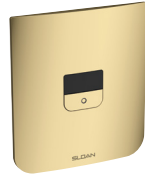
Polished Brass (PVDPB)