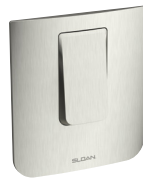
Brushed Nickel (PVDBN)