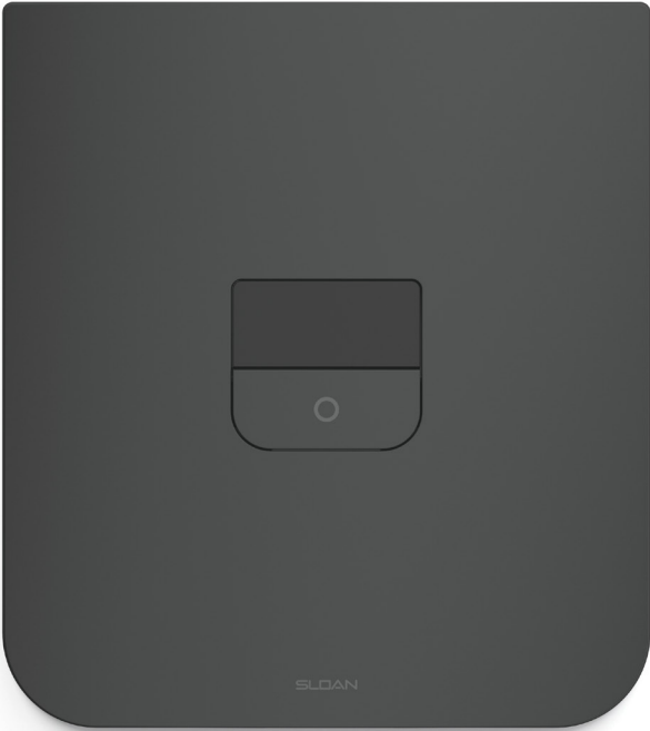
Graphite (PVDGR) - Sensor-activated