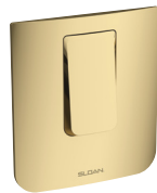
Polished Brass (PVDPB)