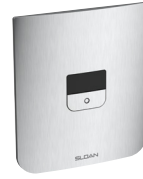
Brushed Stainless (PVDSF)