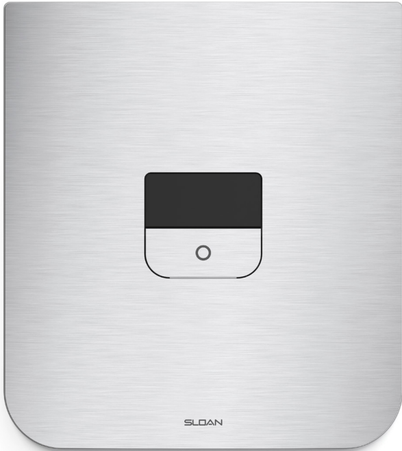
Brushed Stainless (PVDSF) - Sensor-activated