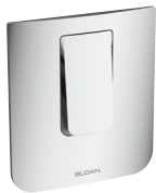
Polished Chrome (CP)