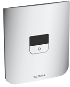
Polished Chrome (CP)