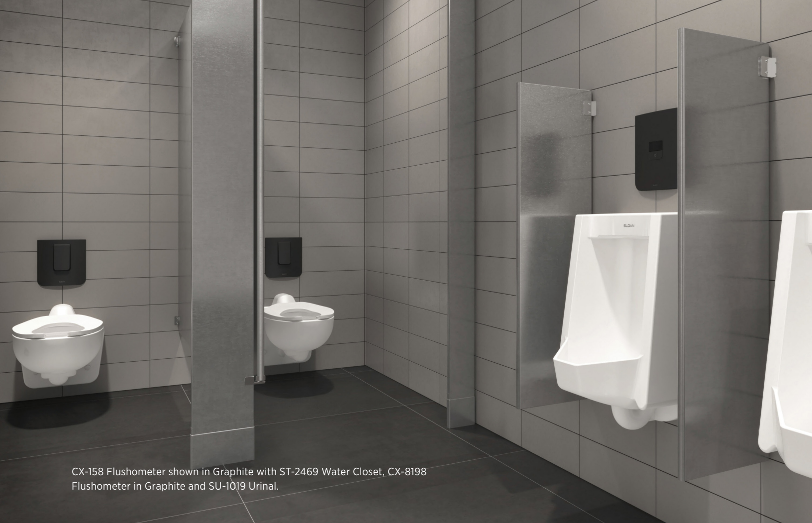
CX-158 Flushometer shown in Graphite with ST-2469 Water Closet, CX-8198 Flushometer in Graphite and SU-1019 Urinal.