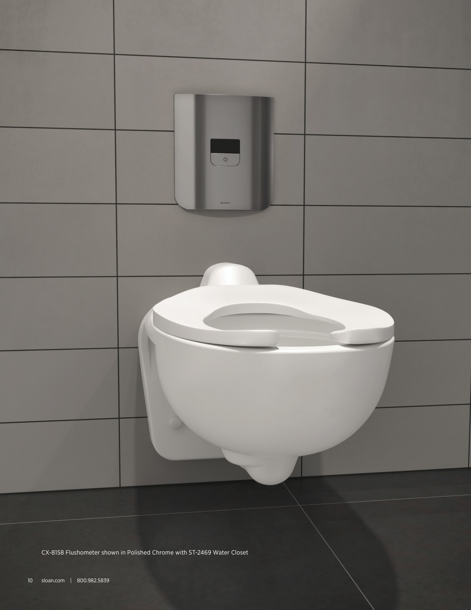
CX-8158 Flushometer shown in Polished Chrome with ST-2469 Water Closet