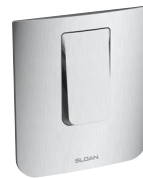
Brushed Stainless (PVDSF)