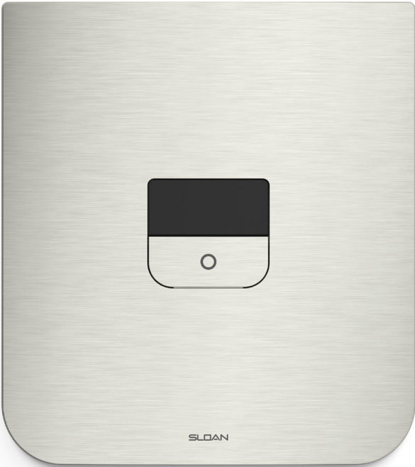
Brushed Nickel (PVDBN) - Sensor-activated