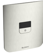
Brushed Nickel (PVDBN)